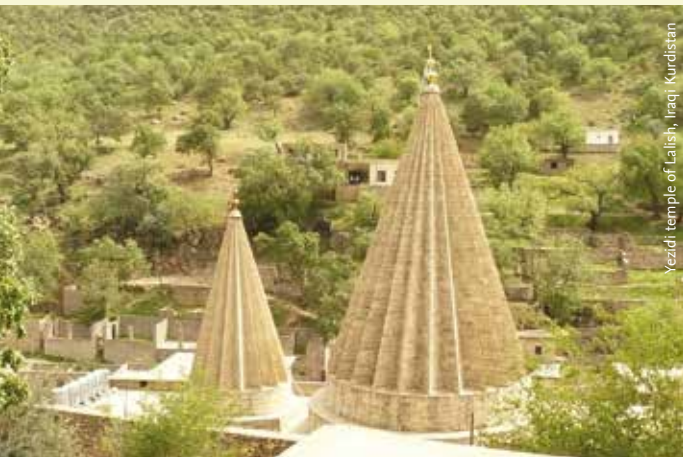
Yezidi temple of Lalish, Iraq, Kurdistan

Within the M.A. Iranian Studies, the students have the opportunity to obtain 20 credits from other departments.