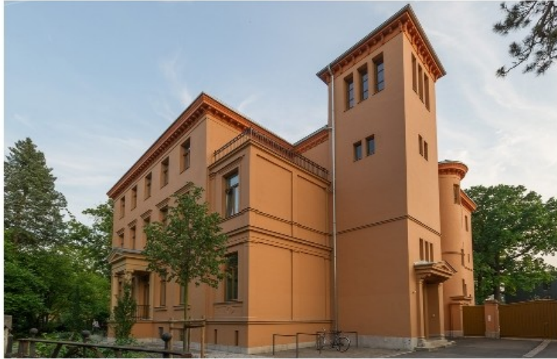
Institute for European Urban Studies (IfEU)