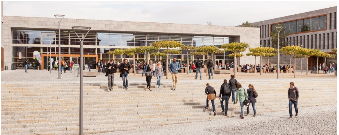
Fulda University campus