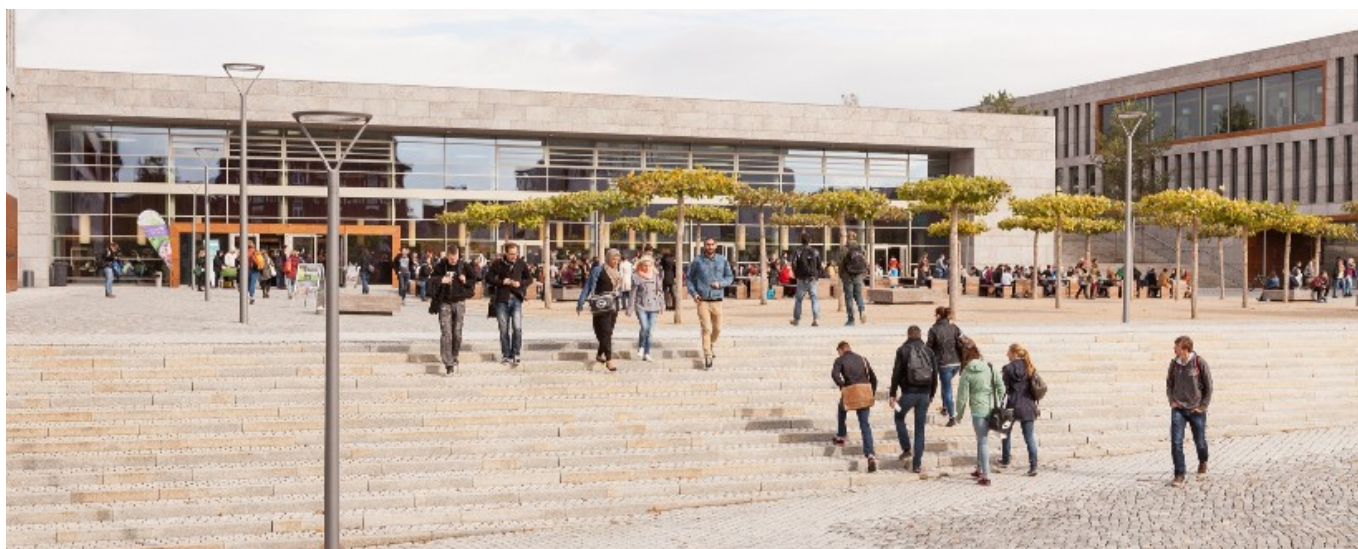
Fulda University campus