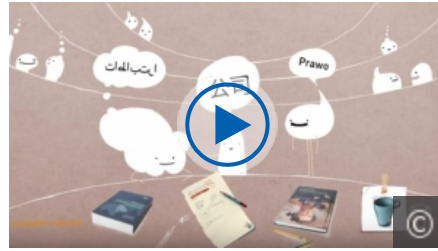
Image video of the Department of Social and Cultural Sciences

EU institutions, EU policy, digitalisation and intercultural communication – the ICEUS MA programme in Fulda provides a comprehensive scientific understanding and a broad knowledge of EU integration policy, especially after fascinating trips to Strasbourg and Brussels. With this background and German and English as the languages of instruction, students will have broad career opportunities. After the mandatory internship, these perspectives will become much clearer.