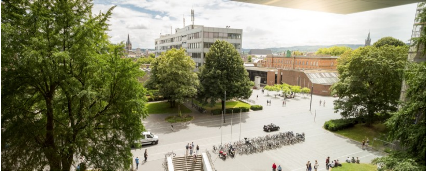
Central part of RWTH Aachen University campus