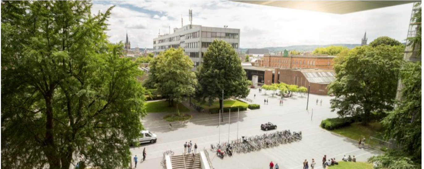
Central part of RWTH Aachen University campus