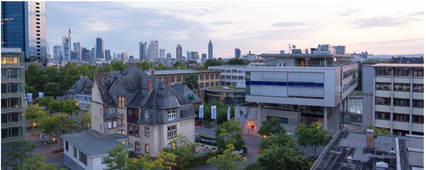
Campus Frankfurt University of Applied Sciences