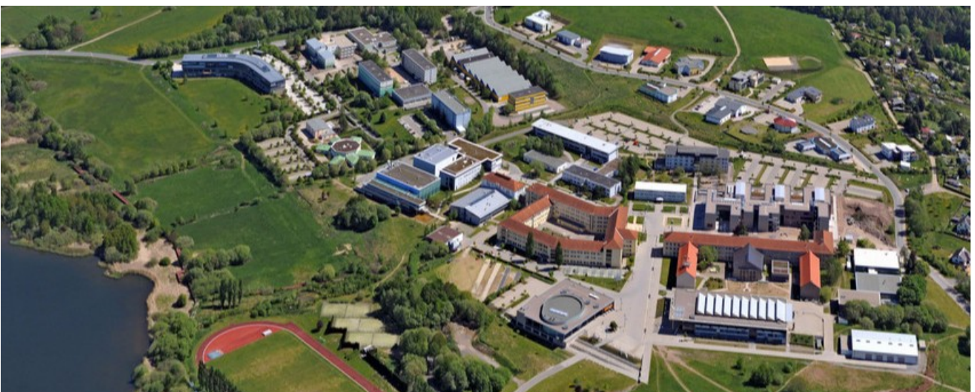
Campus of the Technische Universität Ilmenau