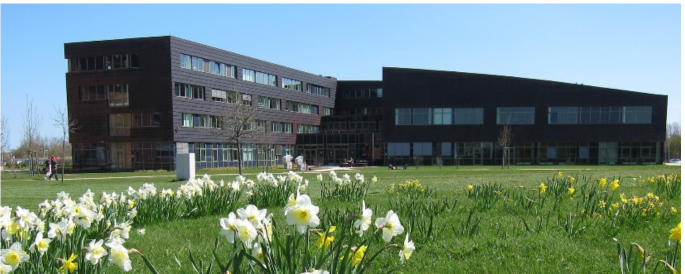
The Helsinki Building