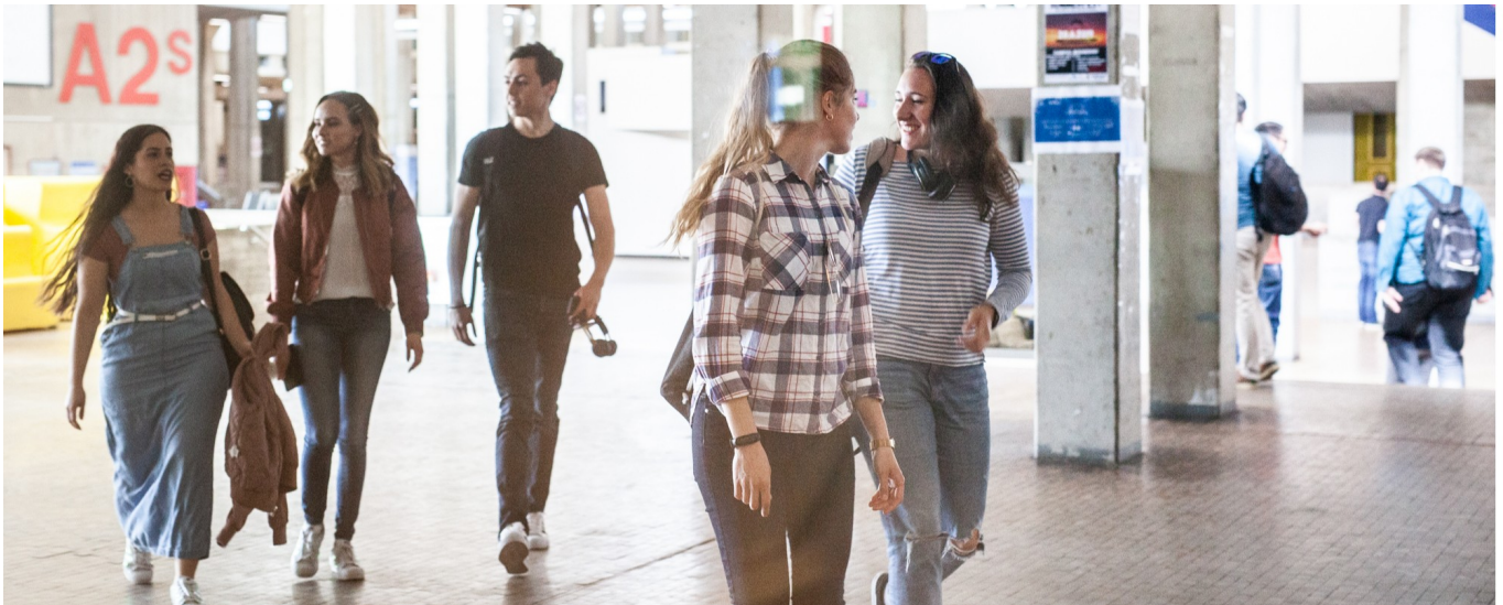
HAW Hamburg – Bergedorf campus – Life Sciences