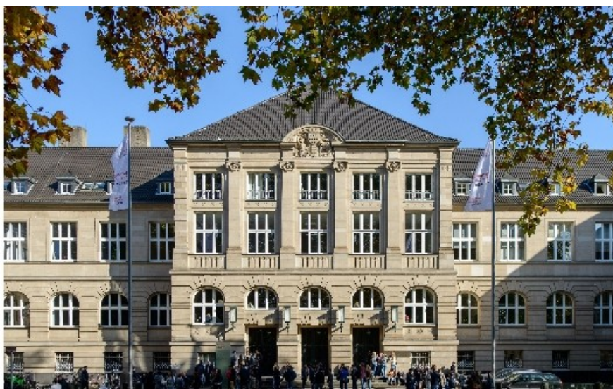
Main building, Südstadt Campus, TH Köln