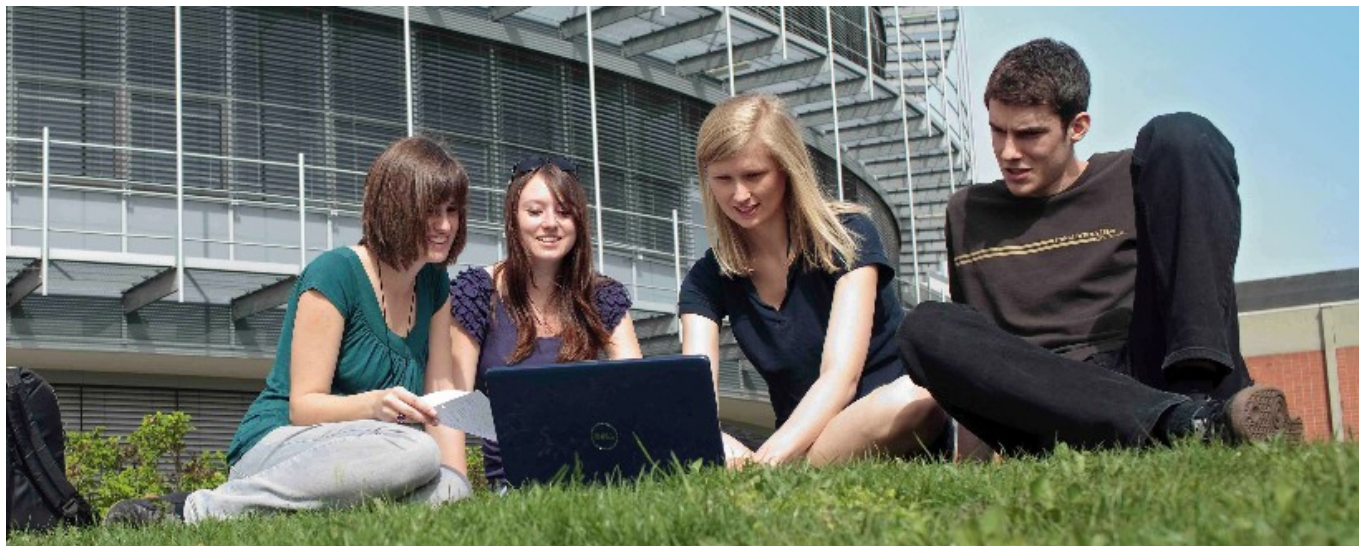
Campus I in Schweinfurt