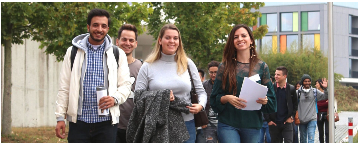
International students on campus