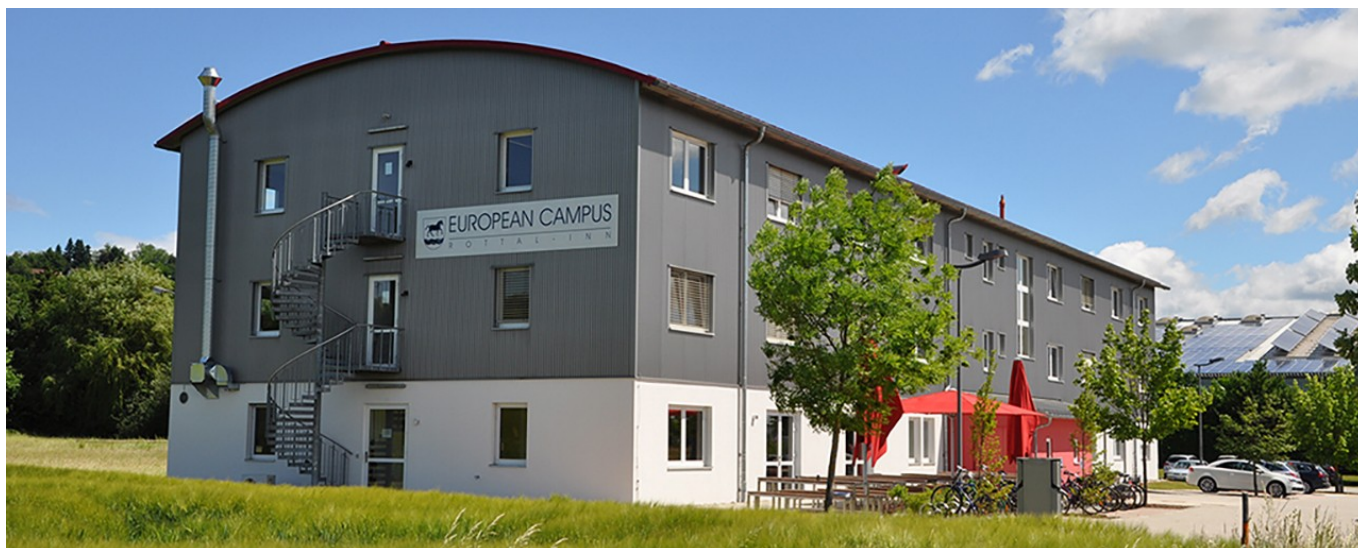
Deggendorf Institute of Technology / European Campus