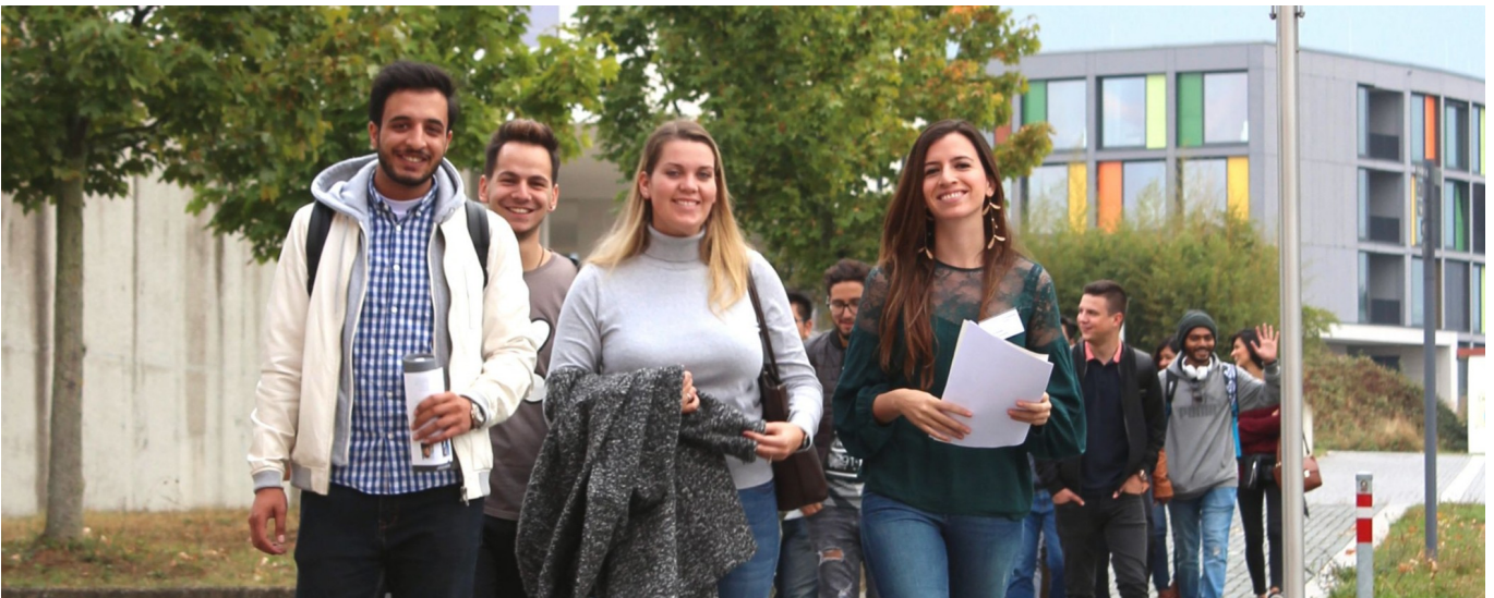
International students on the Hof University campus