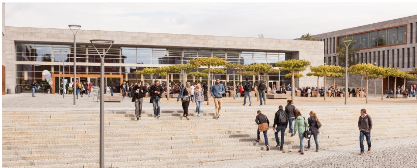
Fulda University campus