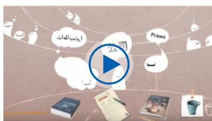
Image video of the Department of Social and Cultural Sciences

I'm an Indian student of Human Rights Studies in Politics, Law and Society. My journey with Hochschule Fulda University of Applied Sciences has been a knowledgeable experience: I learnt a lot of things which include intercultural communication, social justice, grounded theory and human rights. My professors are very helpful – especially when I reach the limits of my German language skills. The atmosphere among my classmates is very inspiring and I feel welcome and comfortable at my department.