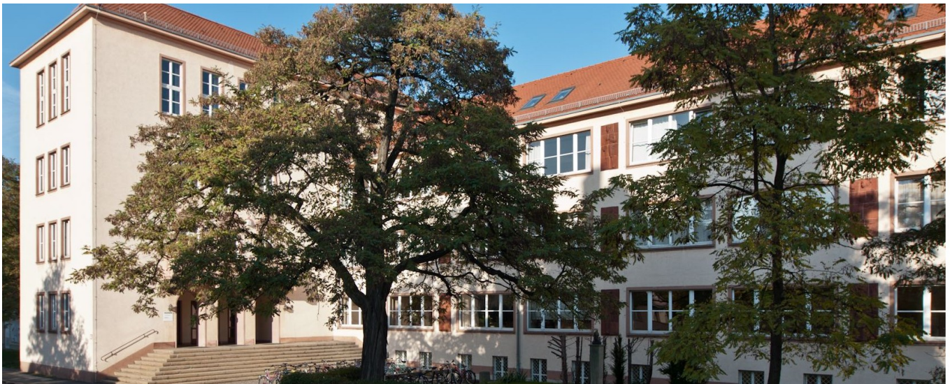
Unser Institut in der Lumumbastraße / Our institute on Lumumbastraße