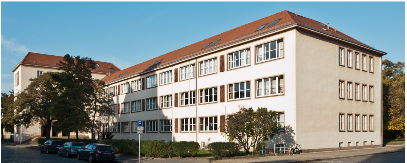
Unser Institut in der Lumumbastraße / Our institute on Lumumbastraße