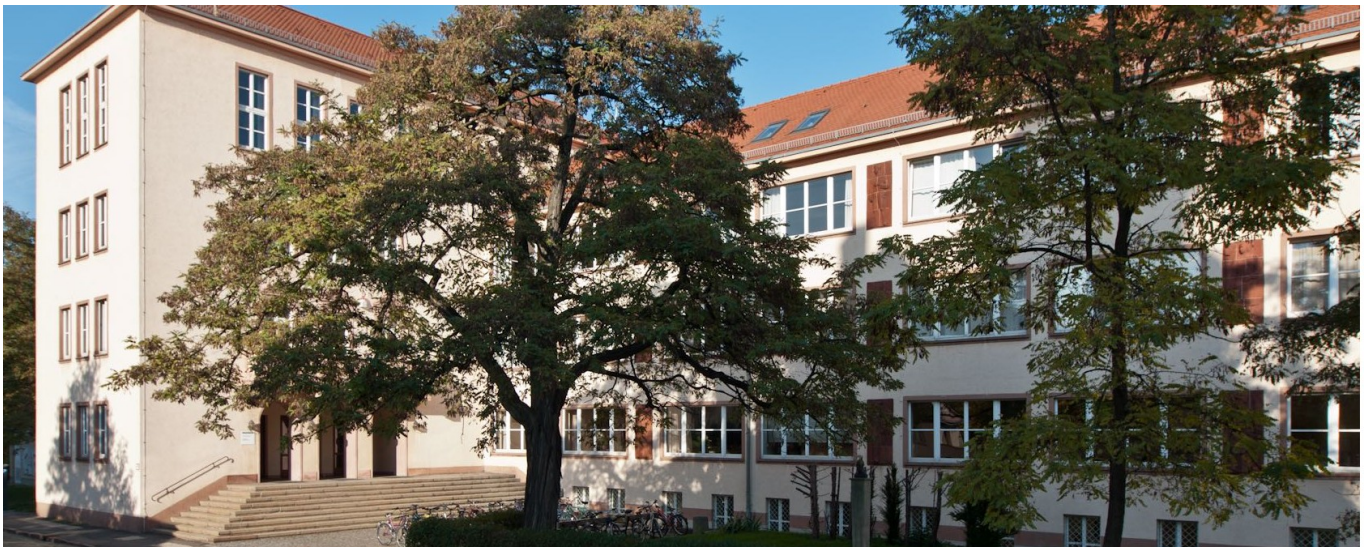
Unser Institut in der Lumumbastraße / Our institute on Lumumbastraße