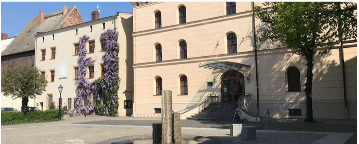
Institut für deutsche Sprache und Kultur e. V. in der Stiftung Leucorea