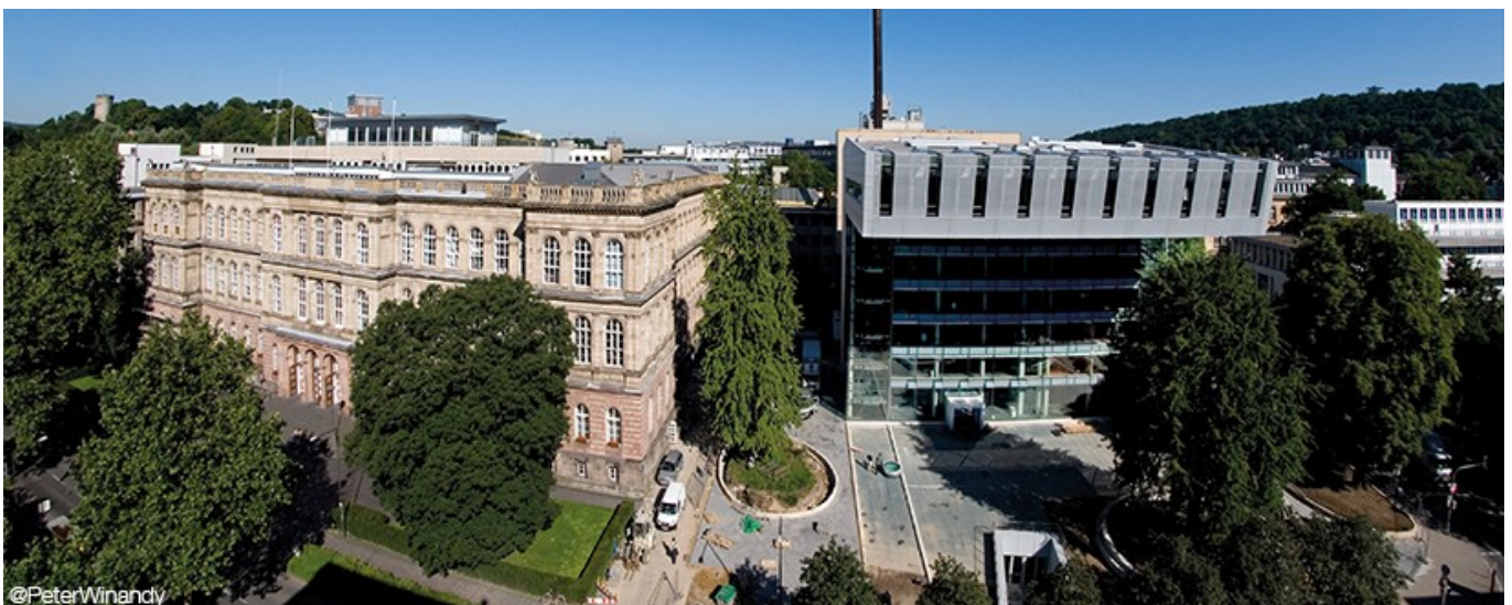
RWTH Aachen University