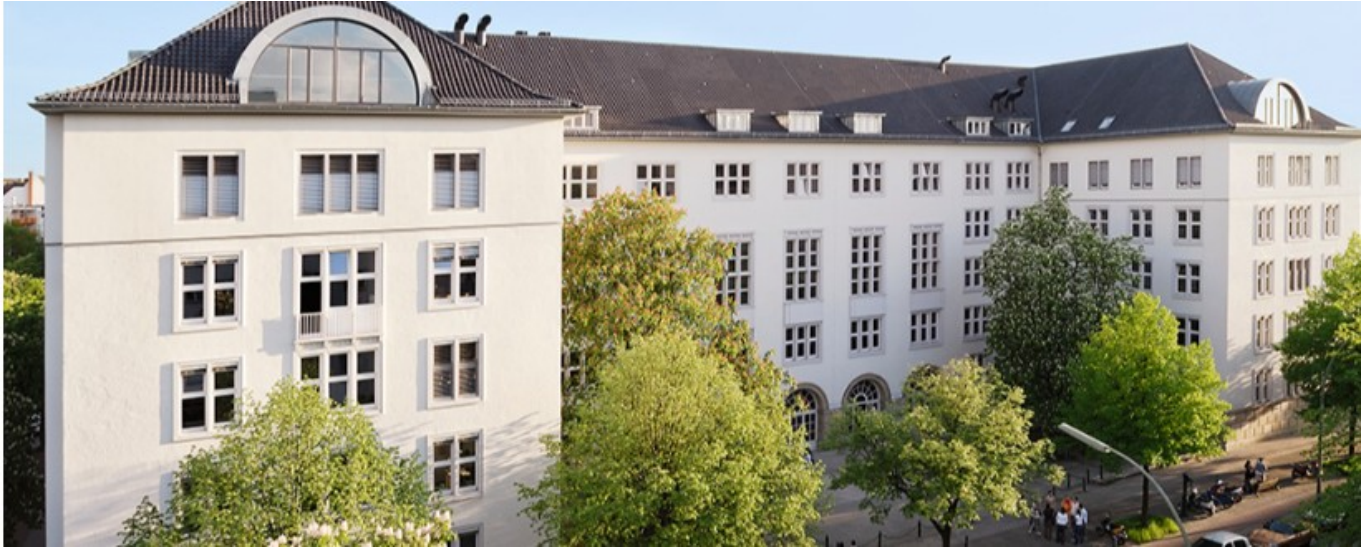
Berlin School of Economics & Law (HWR Berlin)