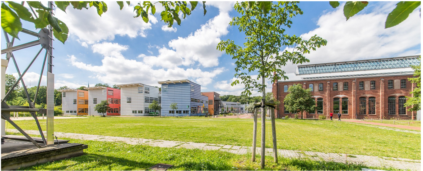
TH Wildau - Campus view