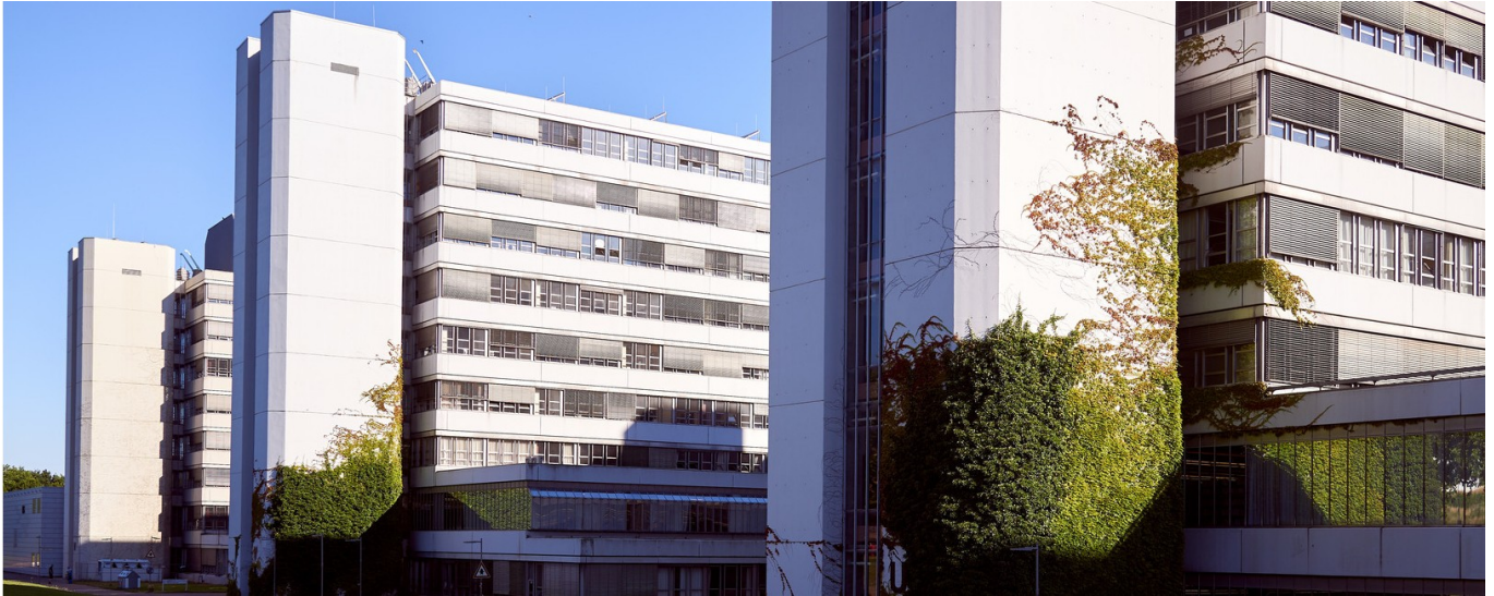
Hauptgebäude Universität Bielefeld / Main building of Bielefeld University