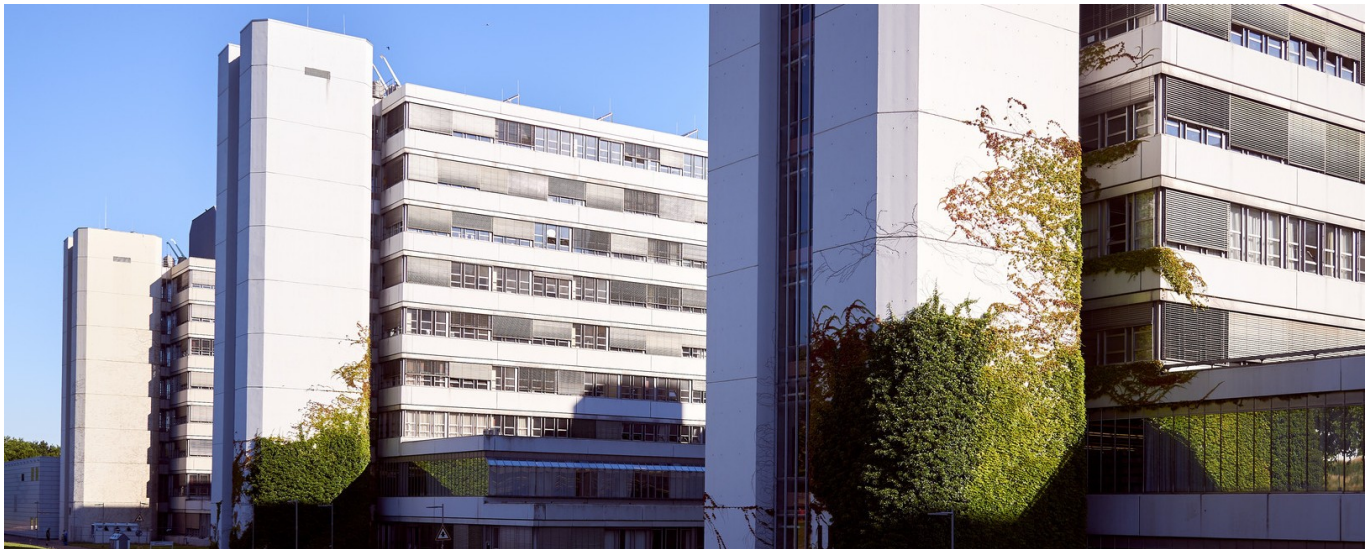
Hauptgebäude Universität Bielefeld / Main building of Bielefeld University