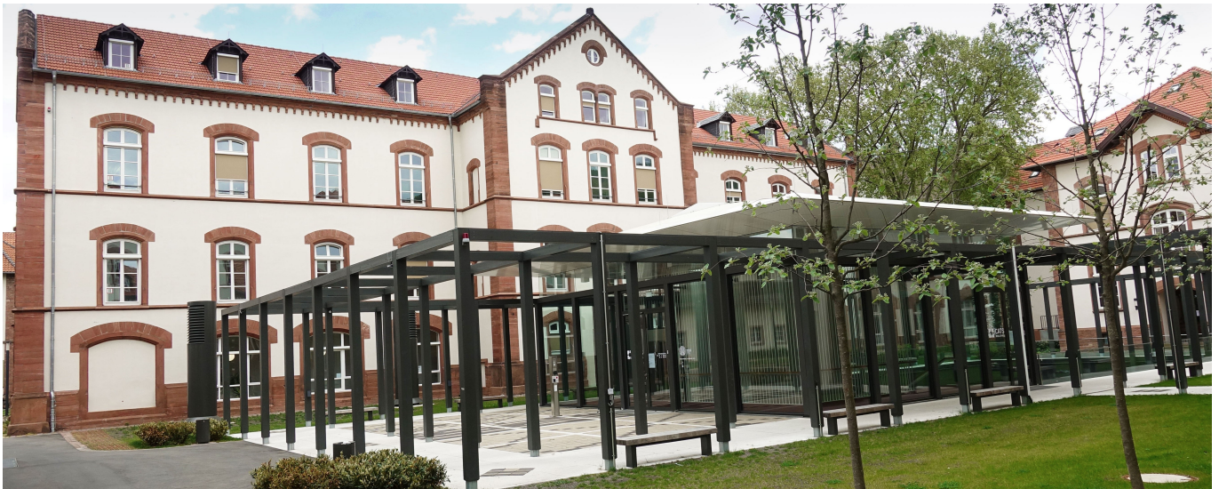
South Asia Institute

Heidelberg University is a comprehensive university integrating the natural and social sciences with the humanities. It is one of Germany's top universities (Germany's leading university in QS World University Ranking) and one of the oldest in Europe, with approximately 30,000 students from 130 countries. The South Asia Institute is Europe's leading centre for South Asian Studies, with departments of Anthropology, Economics, Geography, History, Political Science, Classical Indology, and modern South Asian Languages and Literatures. Affiliated professors teach Art History, Buddhism, and Media Studies. The South Asia Institute regularly offers courses in eleven South Asian languages, cooperates with other summer schools in Germany and India, and has one of the world's largest libraries in South Asian Studies as well as branch offices in different South Asian countries.