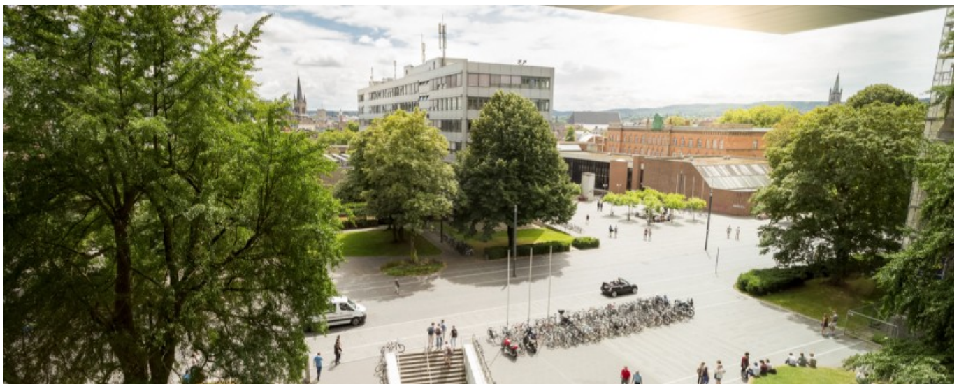
Central part of RWTH Aachen University campus