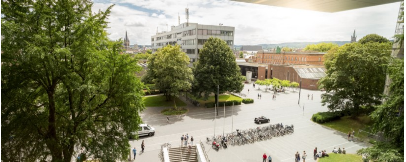
Central part of RWTH Aachen University campus