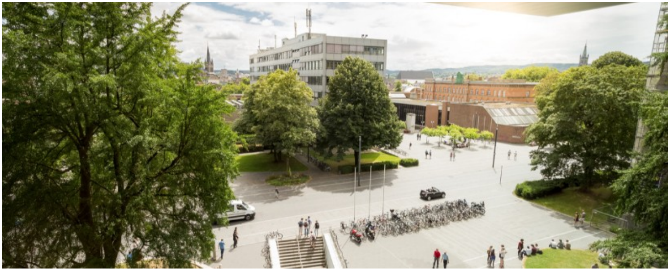
Central part of RWTH Aachen University campus