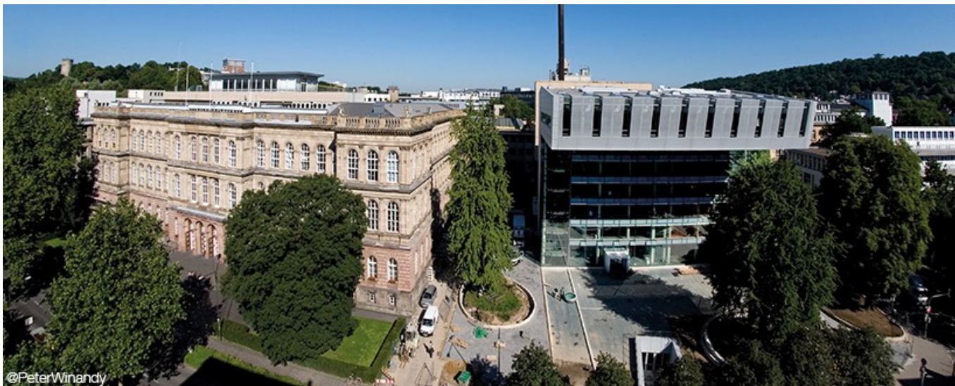
RWTH Aachen University

With 260 institutes, nine faculties and three Clusters of Excellence, RWTH Aachen University is one of Europe's leading institutions for science and research. Currently, more than 47,000 students are enrolled in 173 courses of study. Of these students, more than 14,000 are international students. RWTH Aachen is well-known for its state-of-the-art education that tackles some of the world's most pressing global challenges. Our graduates are highly sought after by businesses and industry as trainees and for executive positions.