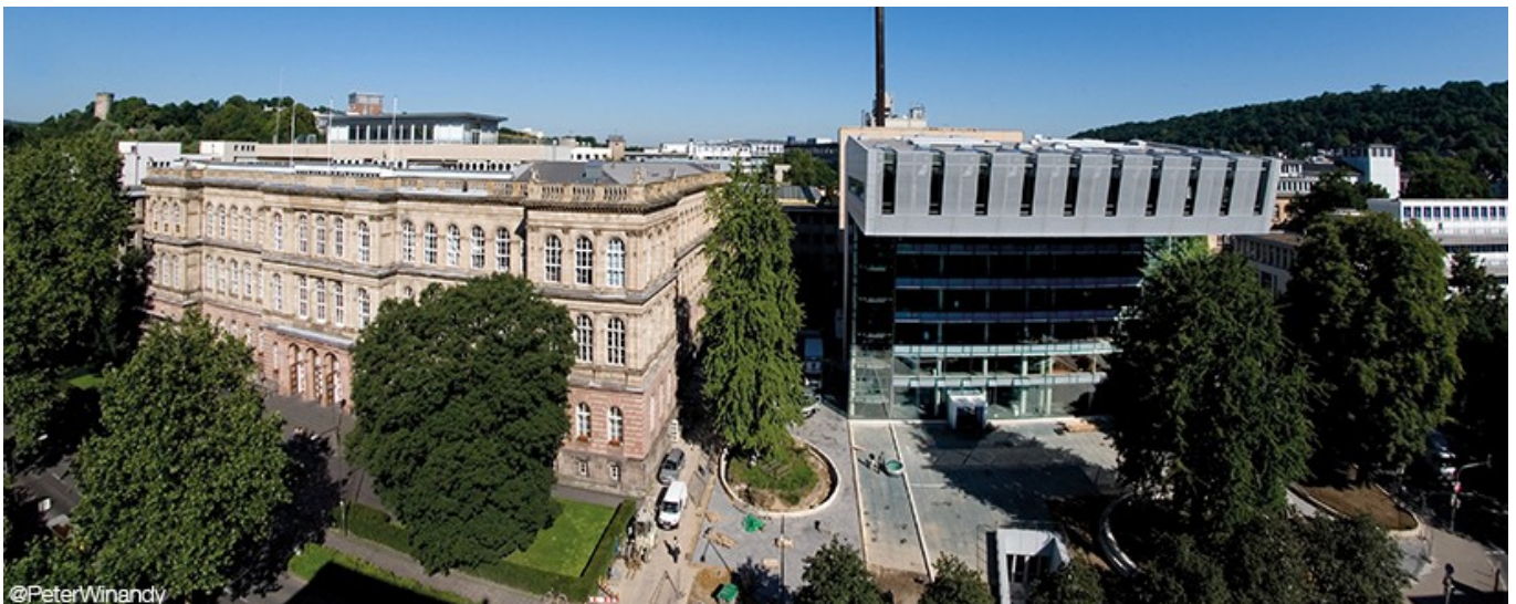
RWTH Aachen University