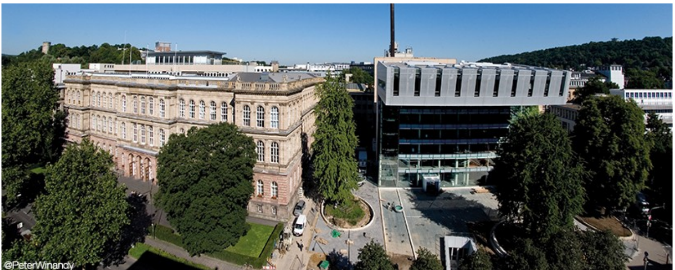
RWTH Aachen University