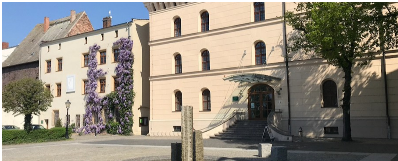
Stiftung Leucorea – Institut für deutsche Sprache und Kultur e. V.