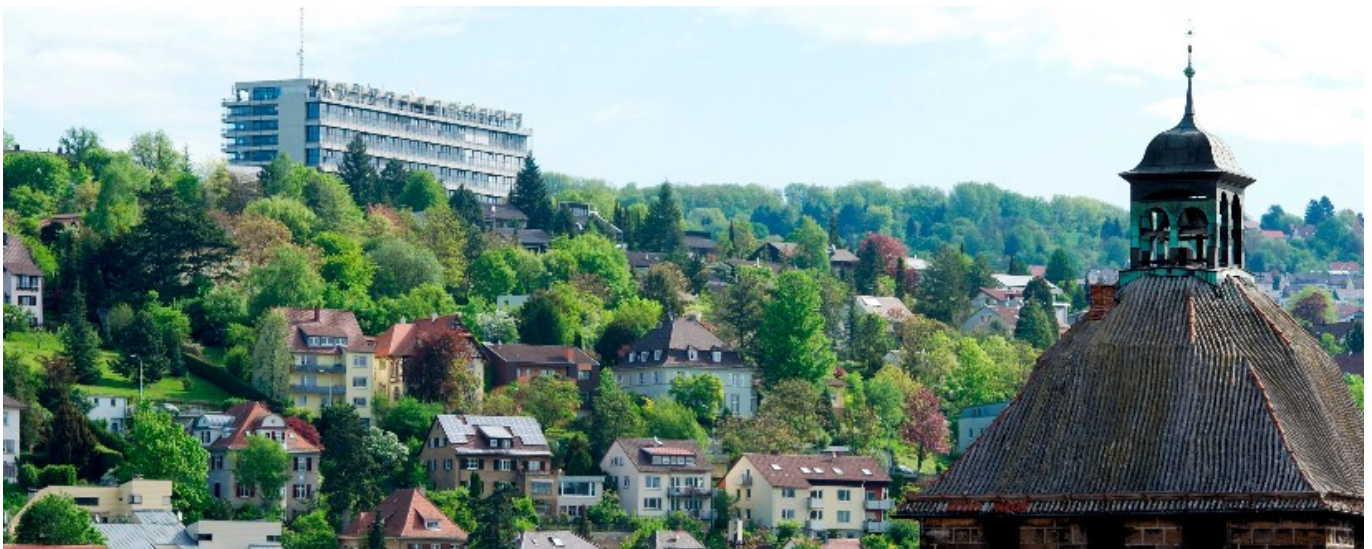
Hilltop campus of the Esslingen University of Applied Sciences