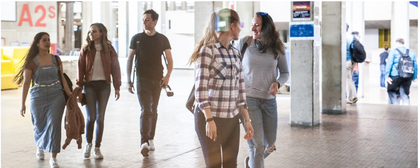
HAW Hamburg Bergedorf campus – Faculty of Life Sciences