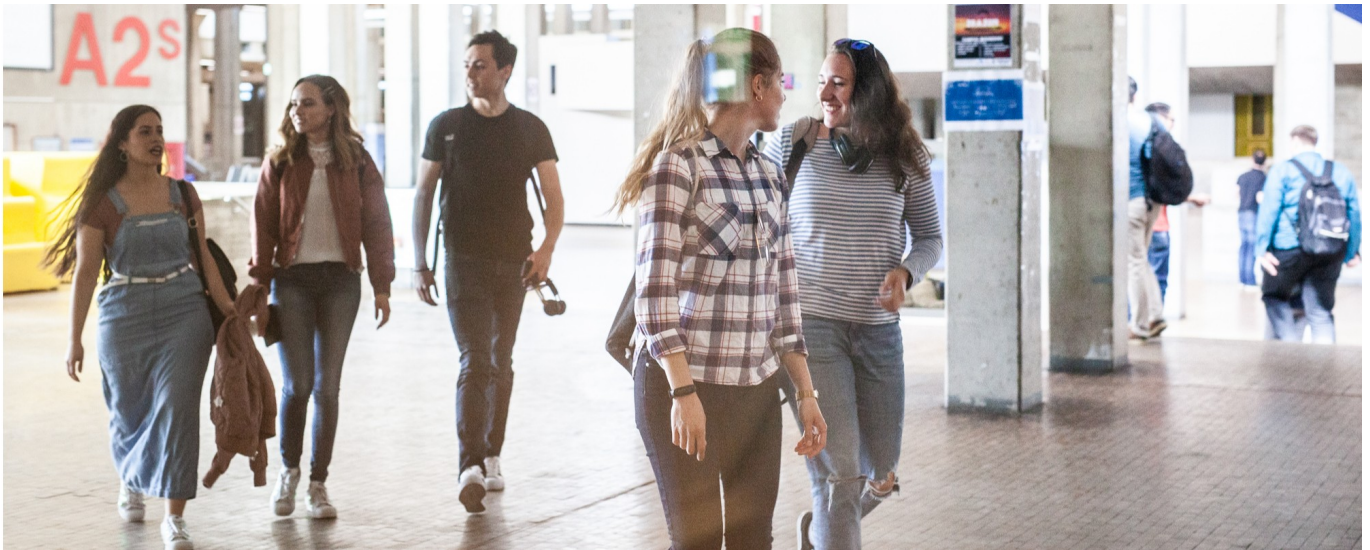
HAW Hamburg Bergedorf campus – Faculty of Life Sciences