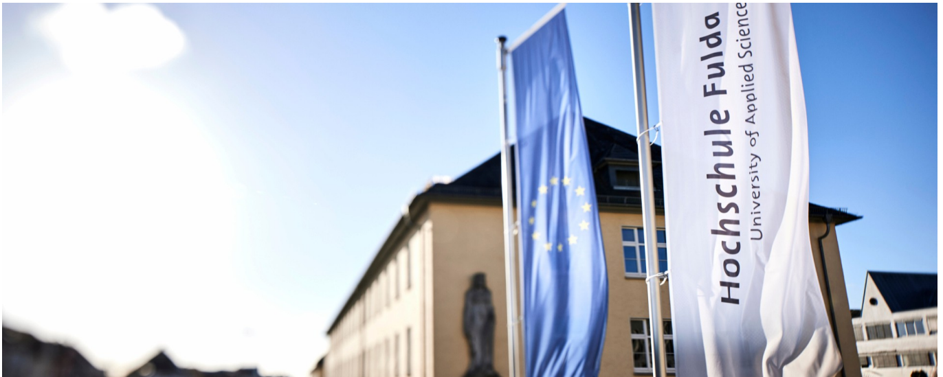
Campus of Fulda University of Applied Sciences