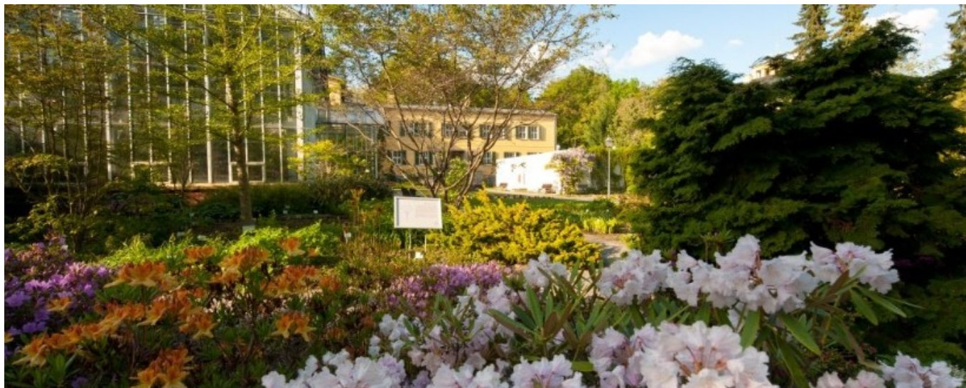
Botanical garden at the Institute of Biochemistry and Biology