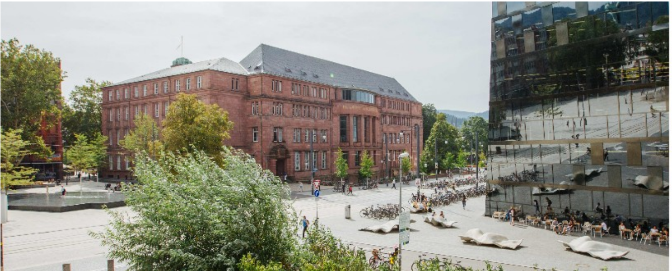
University of Freiburg