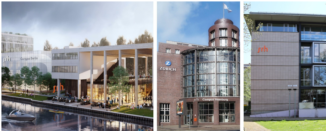
Our campuses in Berlin, Hamburg and Dresden