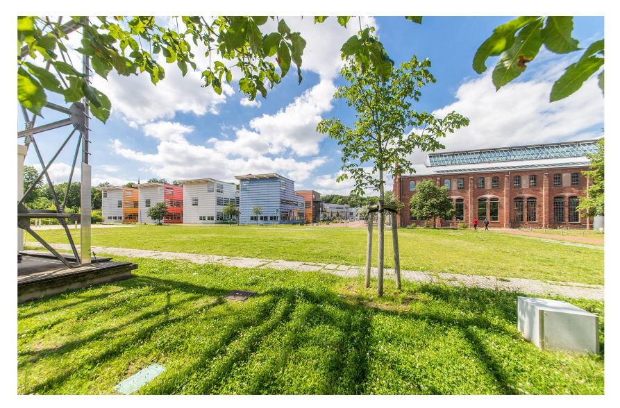
TH Wildau – campus view

Technische Hochschule Wildau – Technical University of Applied Sciences Wildau (TH Wildau) is one of four universities of applied sciences in the state of Brandenburg. By combining the familiarity of a small compact campus with its proximity to the international metropolis of Berlin, TH Wildau offers the best of both worlds.