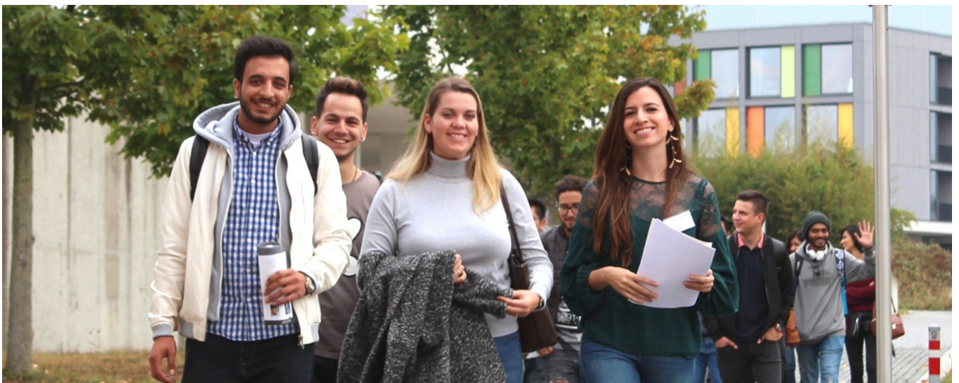
International students on the Hof University campus