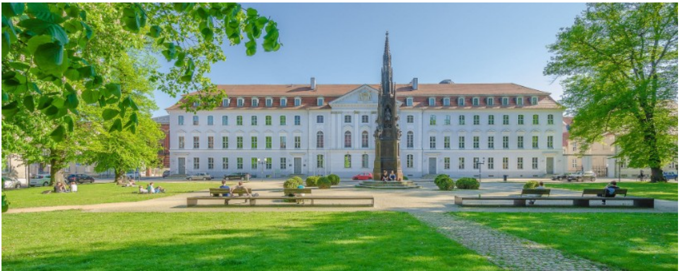
University of Greifswald