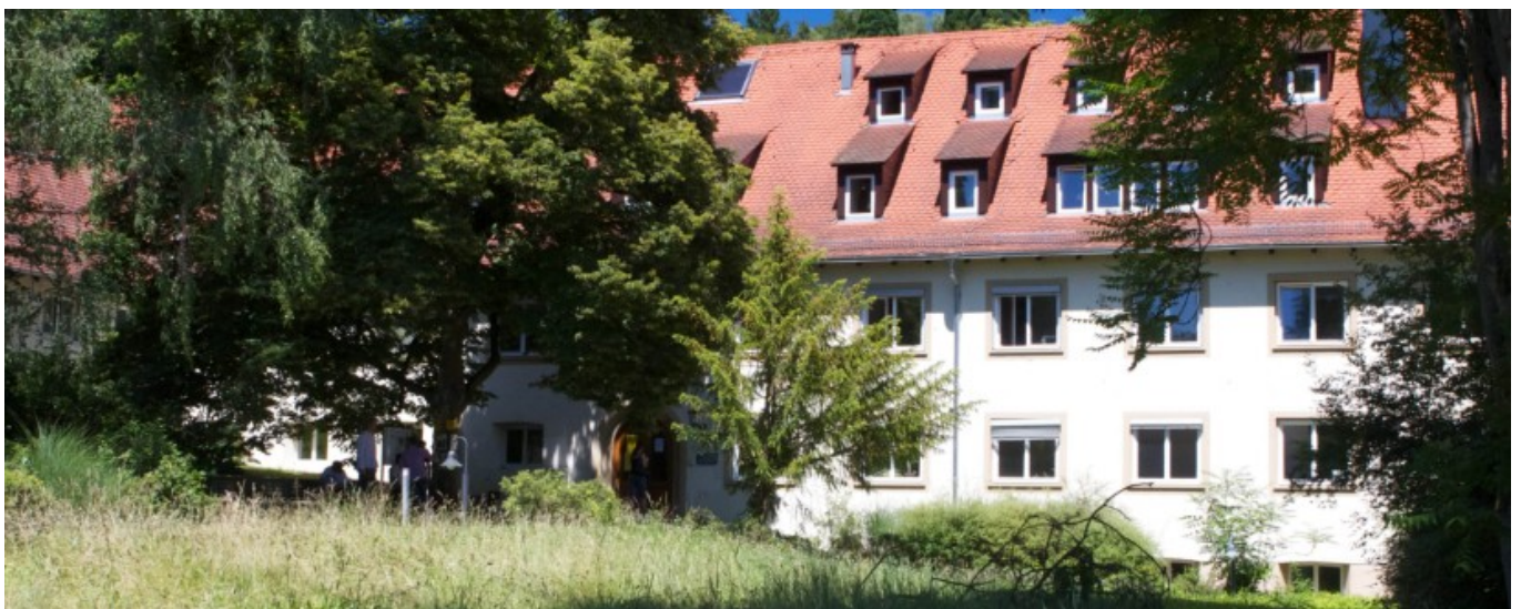
Institute of Political Science in Tübingen