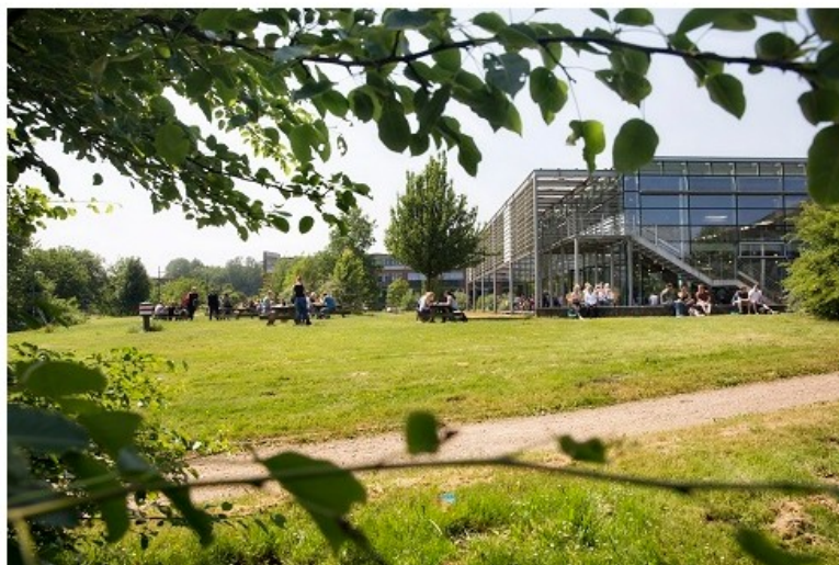
Campus of the Europa-Universität Flensburg

Situated in the German-Danish border region, Germany's northernmost university is a young university. Founded in 1946 by the British, it was awarded university status in 2000. Since 2014, it has been known as "Europa-Universität". In 2017, the Europa-Universität Flensburg (EUF) adapted its semester times to correspond with international semester times: In the spring semester, the lecture period runs from March to June; in the fall semester, it runs from September to December. With around 6,300 students, it is a comparatively small university. Young people from around 90 nations study on the Flensburg campus.