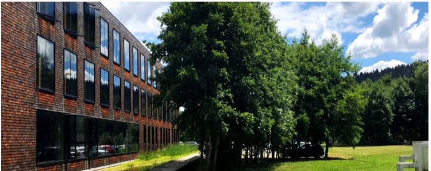
Faculty of Business Information Systems at Furtwangen University Germany