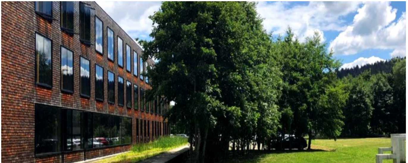
Faculty of Business Information Systems at Furtwangen University Germany