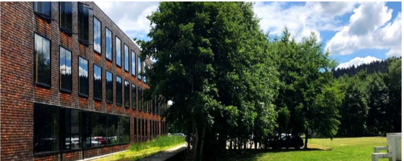
Faculty of Business Information Systems at Furtwangen University Germany