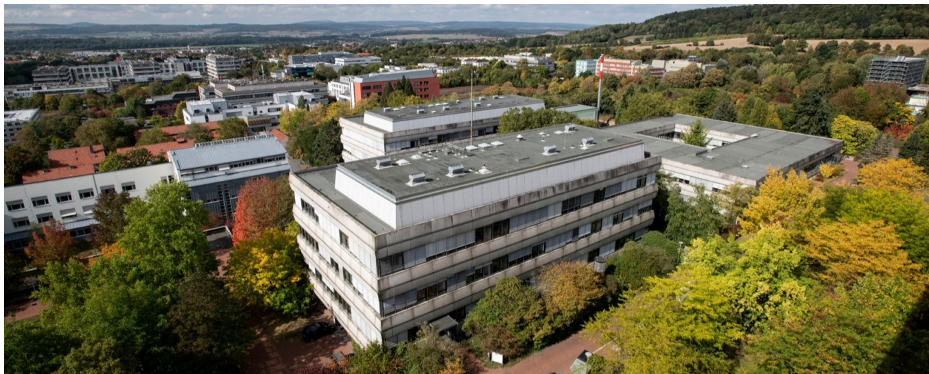
Forest Faculty on North campus of the University of Göttingen