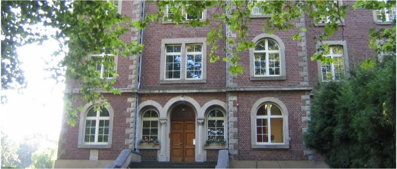
Freshman Program campus in Geilenkirchen