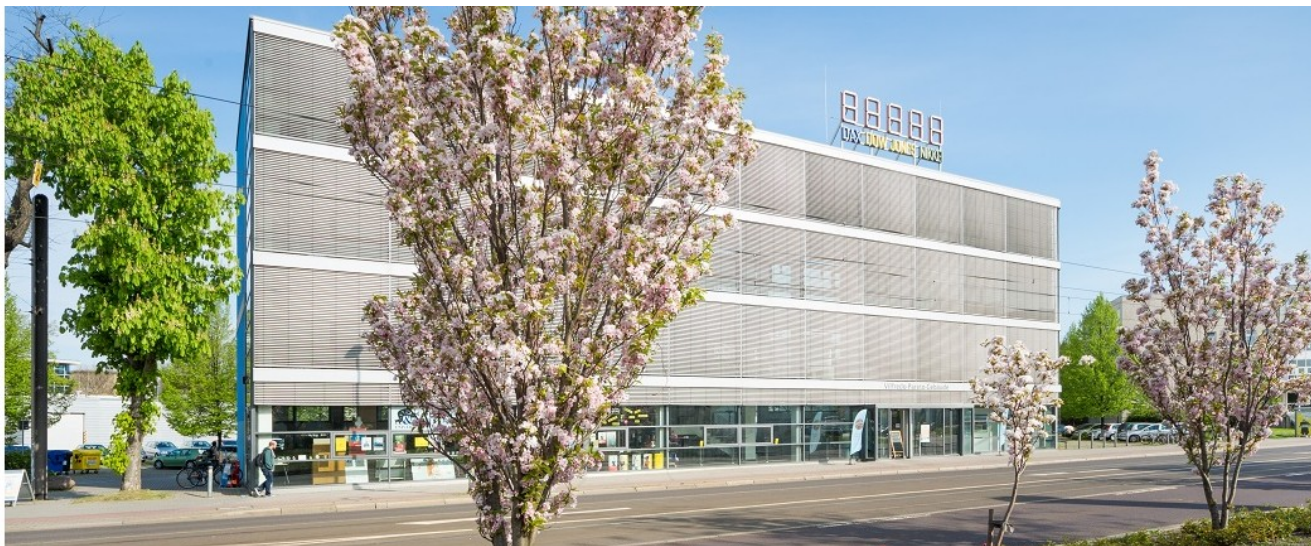
School of Economics and Management at OVGU Magdeburg