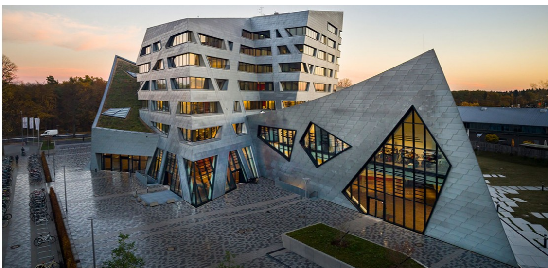
The central building of Leuphana University Lüneburg