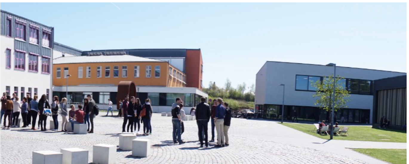
Ostbayerische Technische Hochschule (OTH) Amberg-Weiden / Technical University (OTH) Amberg-Weiden – Weiden campus