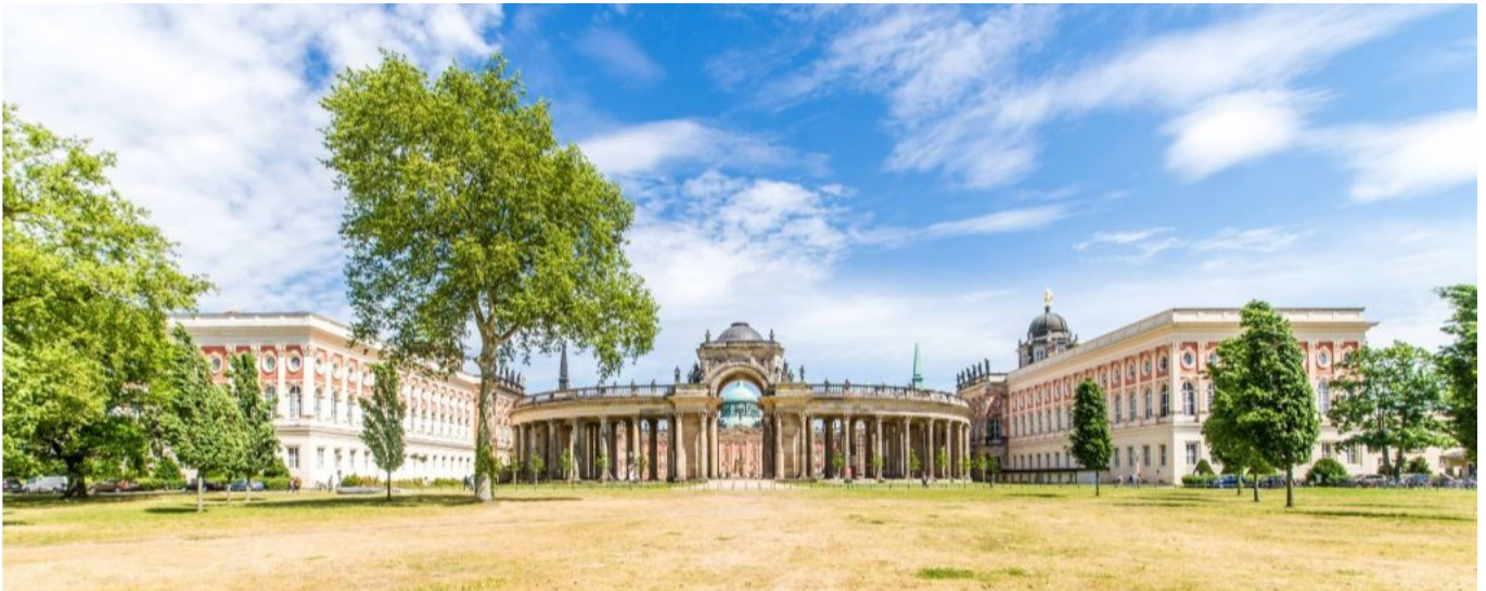
University of Potsdam