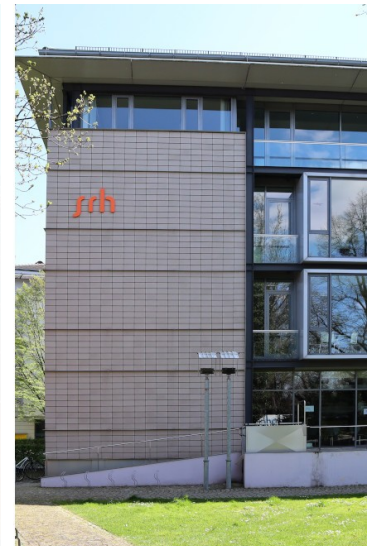
Our campuses in Berlin, Hamburg and Dresden