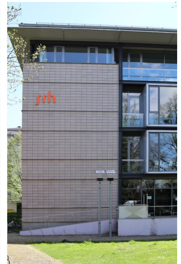
Our campuses in Berlin, Hamburg and Dresden