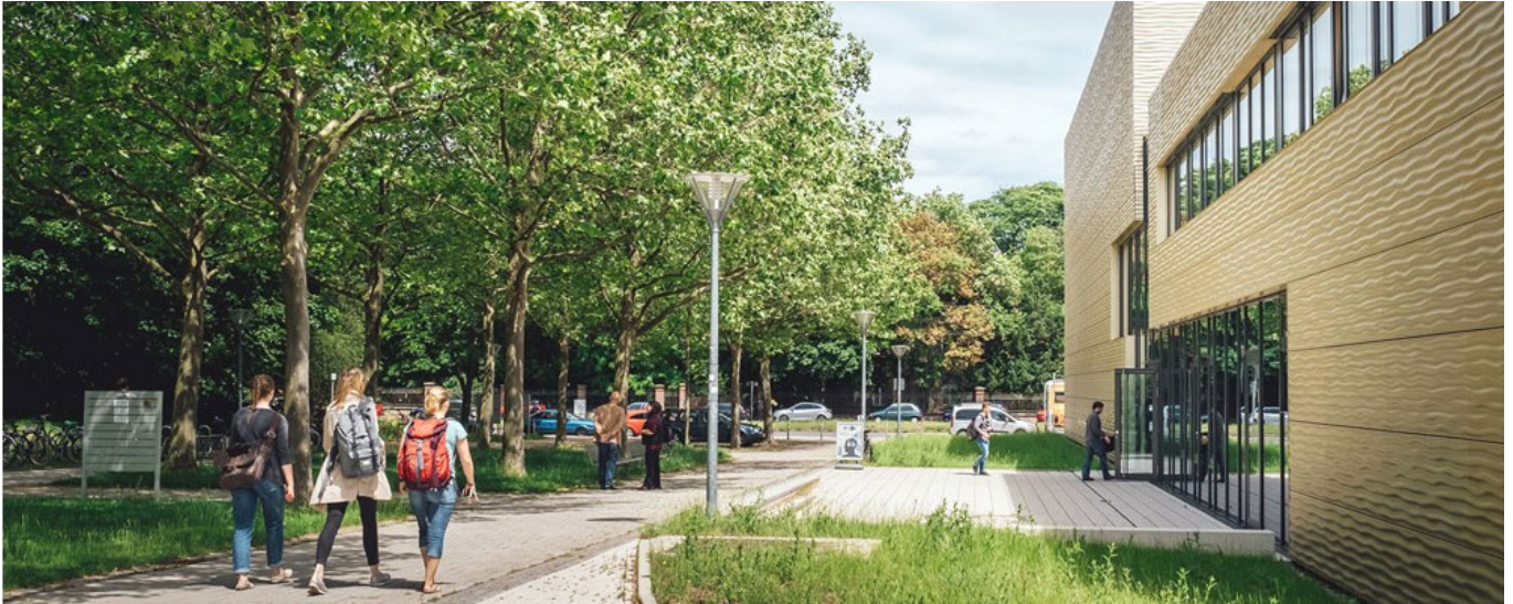
University of Erfurt